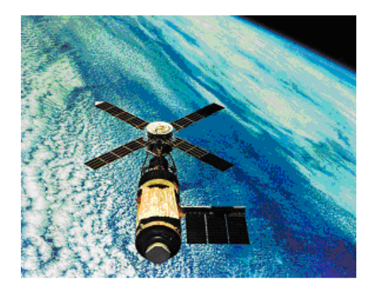
Fig 3 This satellite is a still image from Video 1 (Video 1, MPEG, 2.5 MB).

The video number, file type, and file size should be included in parentheses at the end of the figure caption. See Figure 3 for an example.